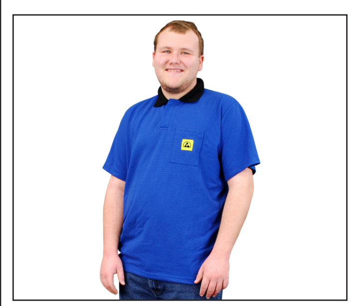
Figure 1. Vermason ESD Polo Shirt