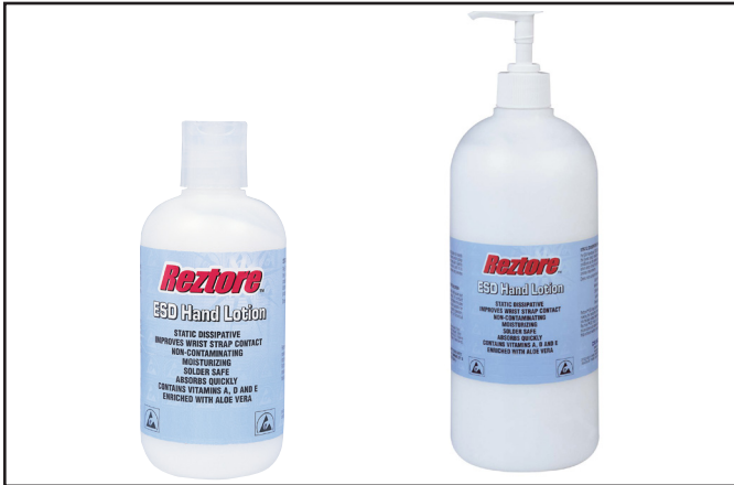
Figure 1. Reztore ® ESD Hand Lotion